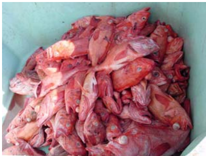
Photo: Rockfish

Full Tech Memo is available at: http://www.afsc.noaa.gov/Publications/AFSC-TM/NOAA-TM-AFSC-136.pdf