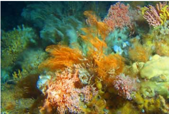
Undersea gardens of coral and sponges provide cover and food for sea life in the Aleutian Islands.

Since 1996, scientists at the Alaska Fisheries Science Center's Auke Bay Laboratory (ABL) have been conducting research on the effects of fishing gear on benthic habitat. Most of the research has focused on the effects of bottom trawls. The use of bottom trawls is one of the more controversial fishing methods due to documented changes in species composition and diversity and a reduction in habitat complexity associated with this gear type.